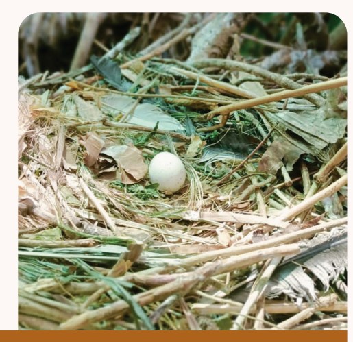
Nesting Activity Seen in Eurasian Spoonbill