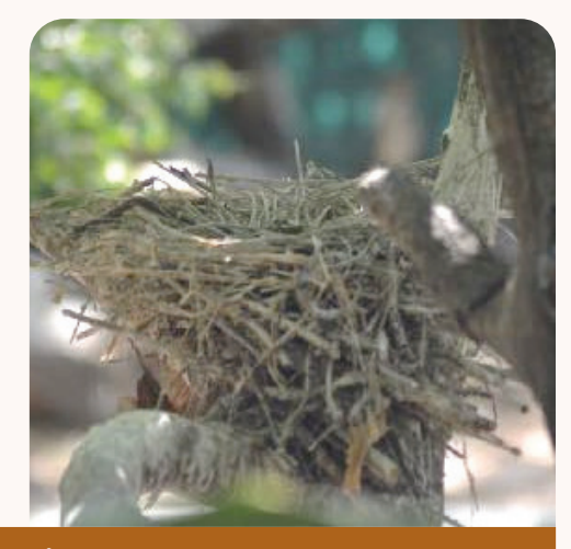
Black Crowned Night Heron Nesting