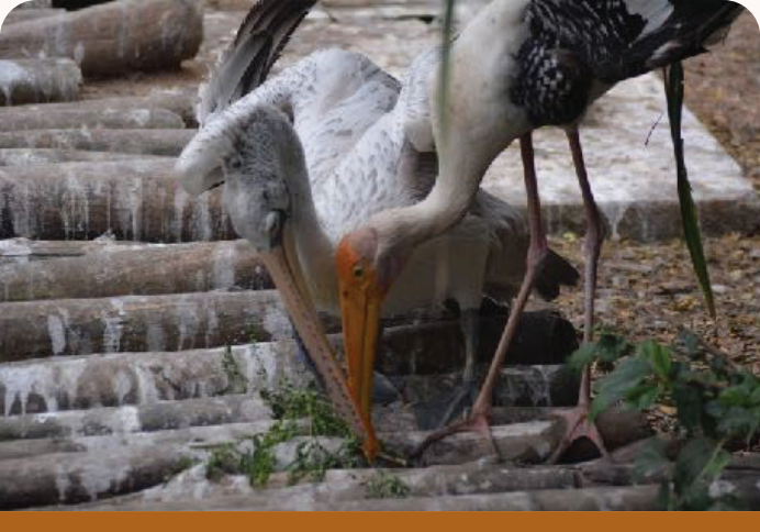
Bonding Seen Between Painted Stork and Spot Billed Pelican Trying to Build Nest